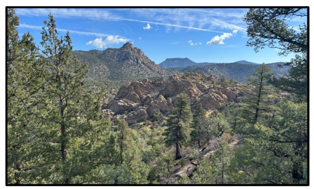
Field Site.